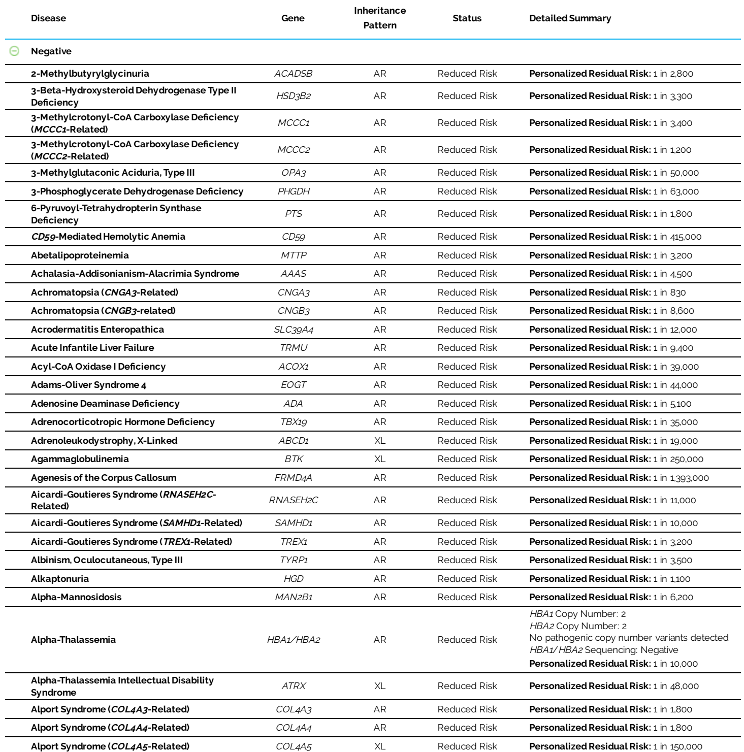
Table 1: List of genes and diseases tested with detailed results

The personalized residual risks listed below are specific to this individual. The complete residual risk table is available at go.sema4.com/residualrisk